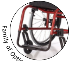
Family of Options

Fully adjustable with a solid, rigid frame, Quickie GP and GPV chairs are engineered to maximize function and performance while minimizing effort for the rider. The extensive array of options and accessories make this model an ideal chair for daily use and sports activities. A variety of wheel options (tires, rims, hubs) are matched to the desires of the rider with choices from no maintenance to high performance, including Quickie Performance Wheels for tennis and basketball.