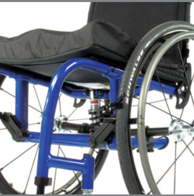
Quickie GT with XTR suspension

You drive our design. In development, we consider how you interact with the chair and how both can work as one to maintain maximum efficiency, performance, style and fit. Before you receive the chair, the product undergoes rigorous testing above and beyond the required testing necessary for federal guidelines. Through our focus on these core elements: design, development and testing; these chairs are designed by you and for you.