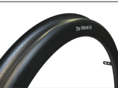
Natural Fit™ Handrim