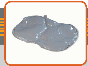
Jay Fluid Tripad