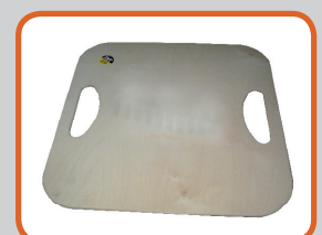
Applewood solid seat (option)