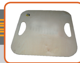
Applewood solid seat (option)