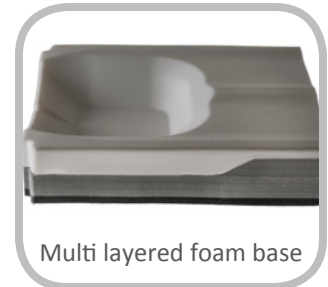
Multi layered foam base