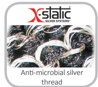
Anti-microbial silver thread